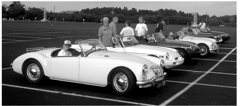
Lining up at the Dog Track for the run to Dade City

The Old Meeting House 901 S. Howard Ave, Tampa, FL 813/254-0567