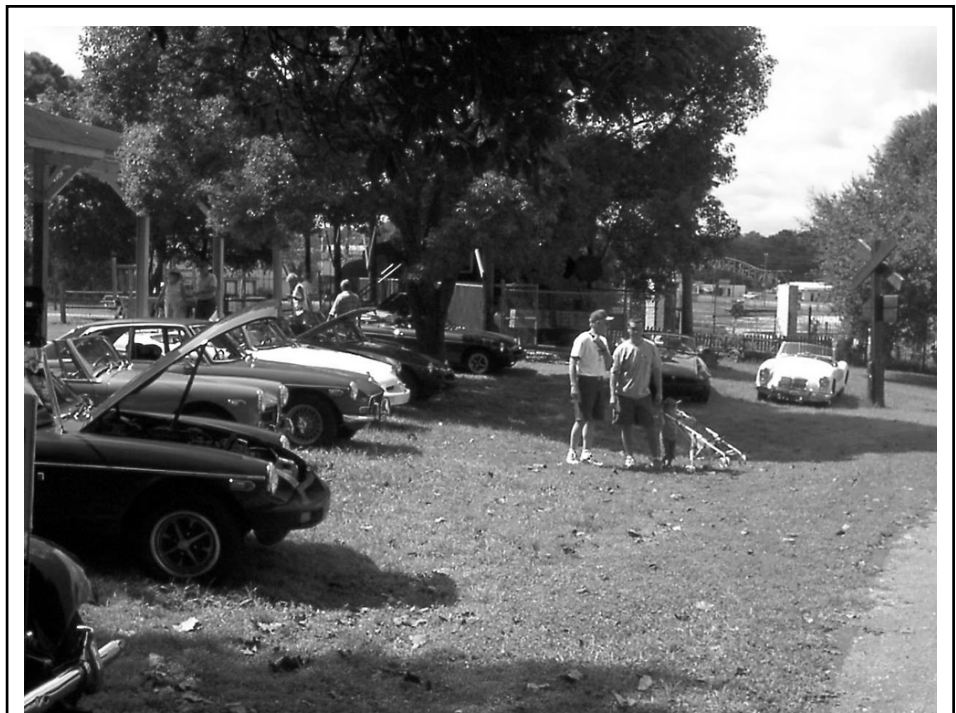
MGs lined up at Dade City Pioneer Day Festival