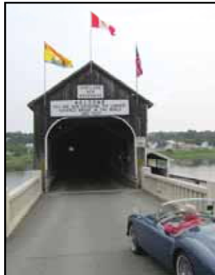
Hartland Covered Bridge, New Brunswick, Canada