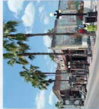
Museum and Tour $17.95 per person

RSVP by Sept. 20 to Jack & Lorrie Maniscalco (813) 968-6138 or tampajem@verizon.net