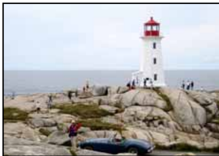
Peggy's Cove, Nova Scotia