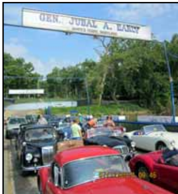
White's Ferry- a dozen MGs crossing the Potomac River together

wonderful sights and met many fine folks. Yet, on August 4th as we crossed Tampa Bay, we were thrilled to be home again in St. Pete.