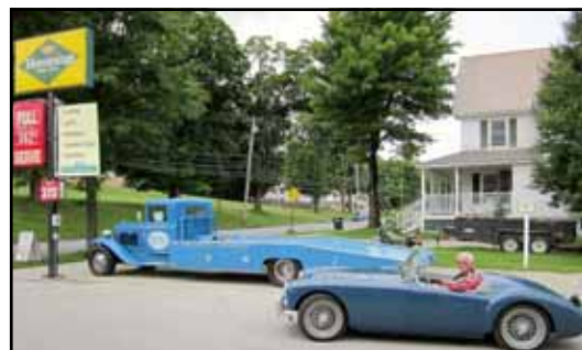
Hemmings Motor Museum, Bennington Vermont