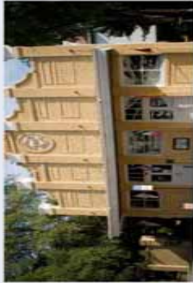
YBOR CITY MUSEUM STATE PARK