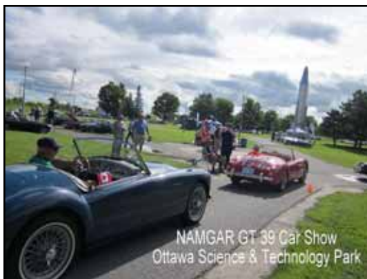
Ottawa GT39 Car Show