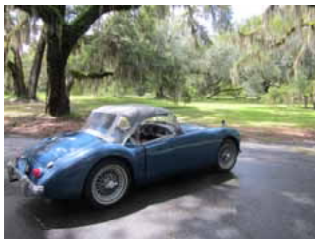
near St. Simons, GA