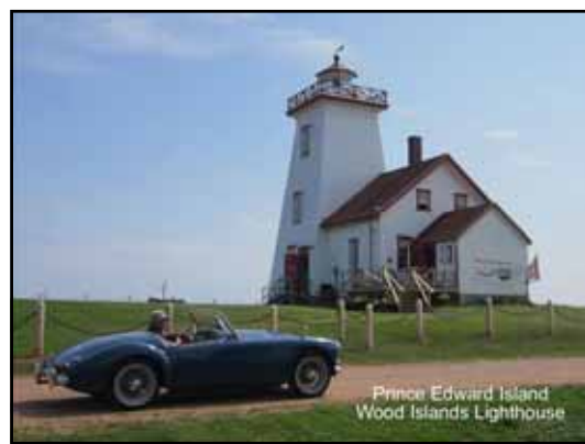
Prince Edward Island-Wood Islands