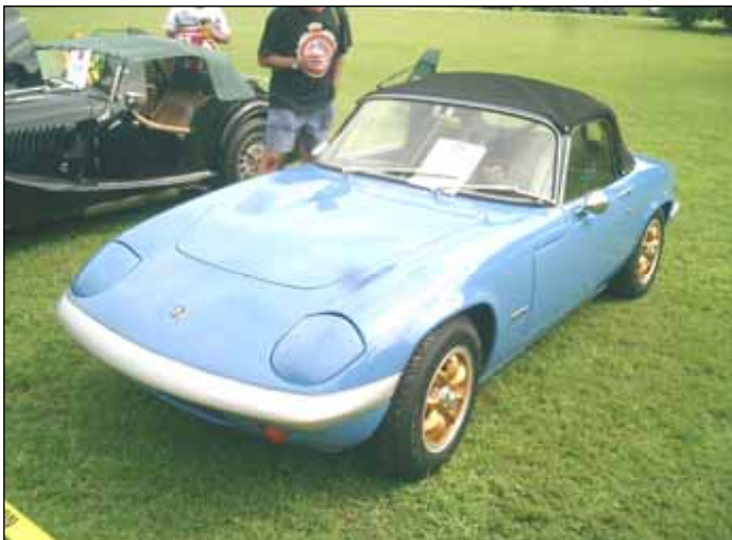
Ed McCarroll 1969 Lotus

Seventy-eight LBC's competed in this years show, down from last years attendance, which was most likely caused by pending weather conditions, although rain only began to fall when the show