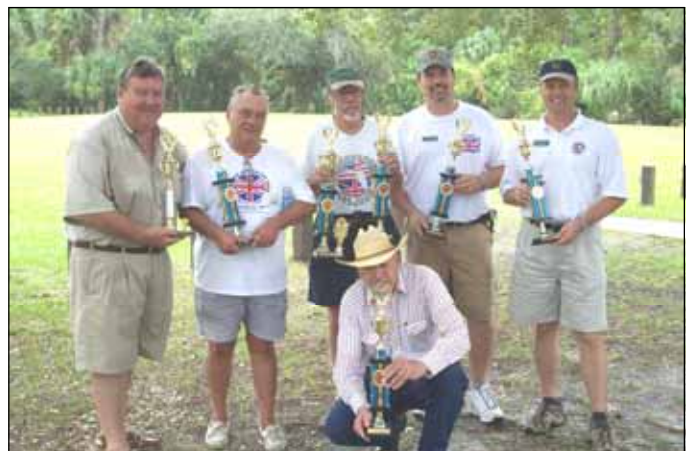
Suncoast British Car Club Winners

Seventy-eight LBC's competed in this years show, down from last years attendance, which was most likely caused by pending weather conditions, although rain only began to fall when the show