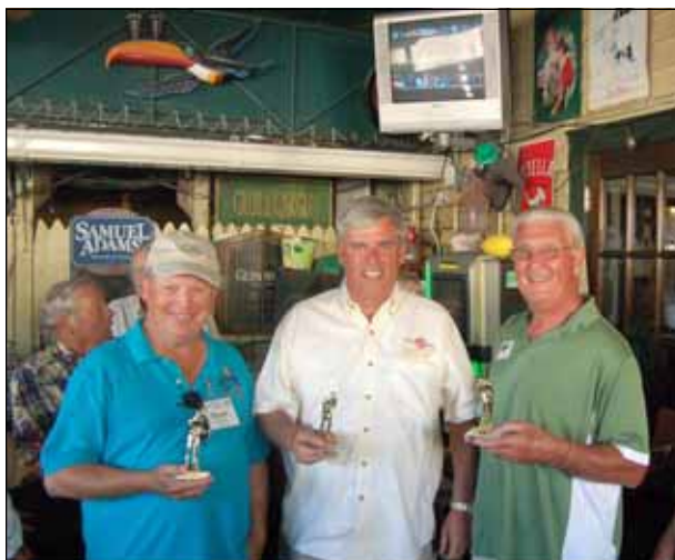
Key West Golf Tournament Champs

The following day we joined about 20 MGs and the N A M G A R crowd in Key Largo to start the scavenger hunt/poker rally along the 100 mile Great Overseas Highway to Key West. The