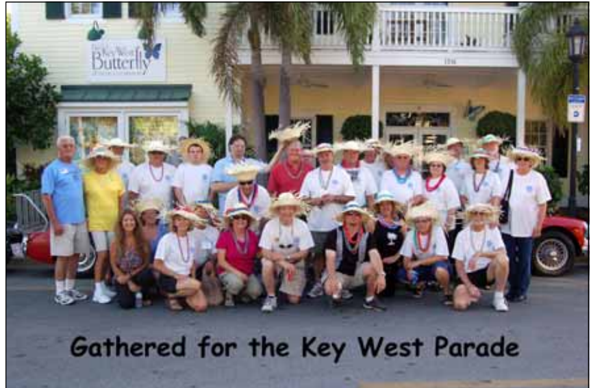
Gathered for the Key West Parade

West the second day. Since we were in no real hurry, we took country roads through central Florida and south along the great Lake Okeechobee stopping at the quaint Clewiston Inn for lunch; then later dining at the Capri Restaurant in Florida City.