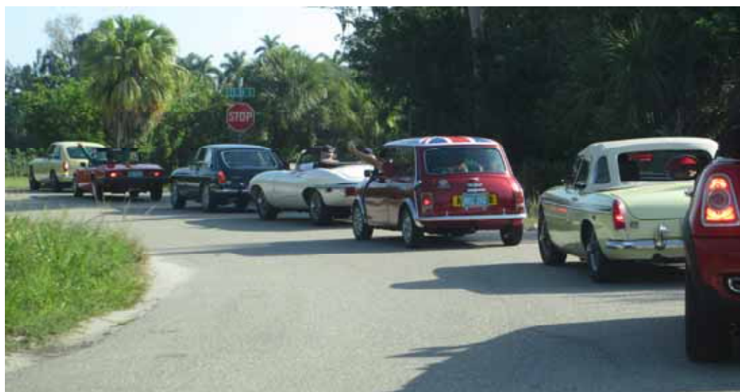
Caravanning to Solomon's Castle