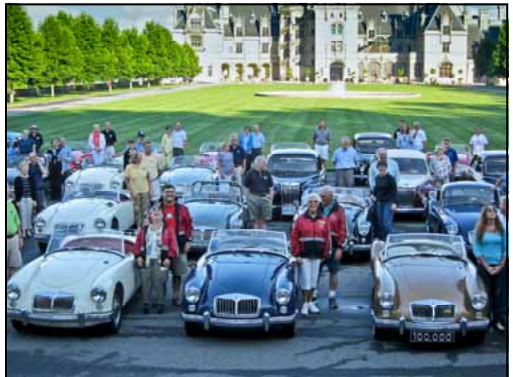
Photos of MGAs, GT-38, Biltmore House, Asheville, N.C.